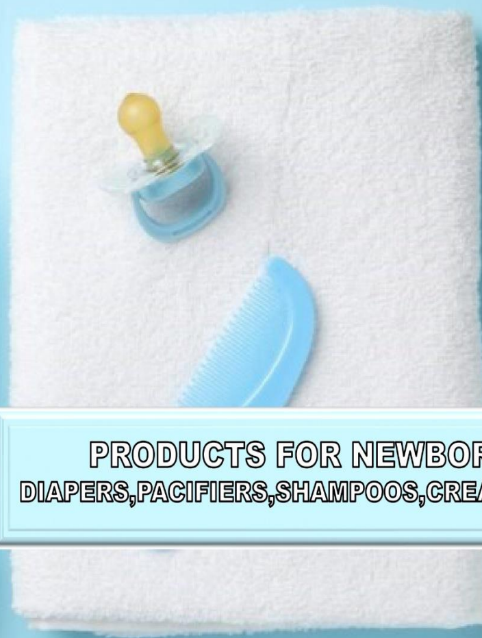
PRODUCTS FOR NEWBORN DIAPERS,PACIFIERS,SHAMPOOS,CREAMS,(...).