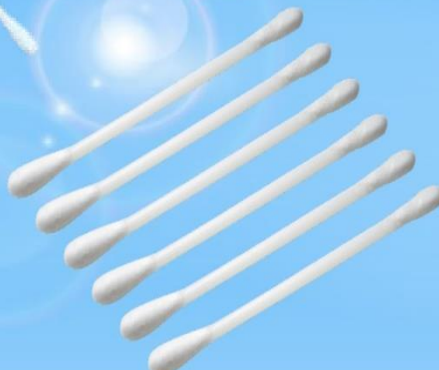
GAUZE, COTTON WOOL, COTTON BUDS.