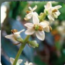
the Flower of the Olive