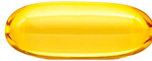
Softgel / Gelcap