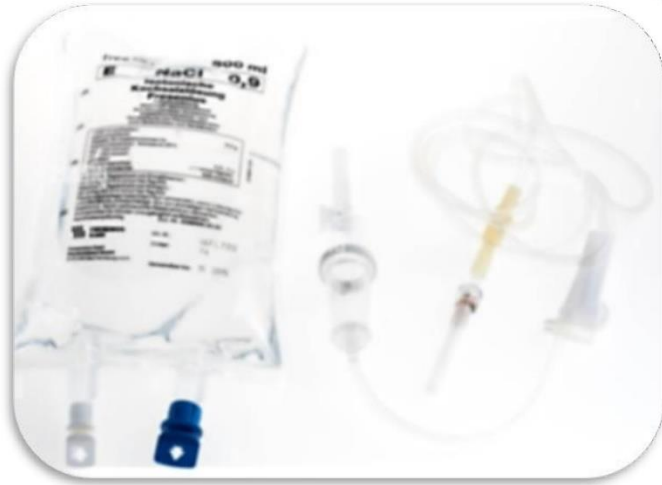
INFUSION SET BLOOD