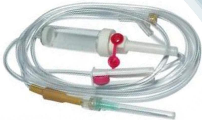
INFUSION SET BLOOD