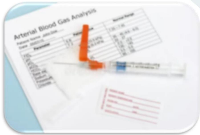
BLOOD GAS SYRINGE